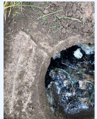
Cracked septic tank

Sewage disposal systems located less than 50 feet to a drinking water well or surface water. A minimum of 50 feet is the established standard to ensure bacteria and viruses are killed before they can contaminate our water.