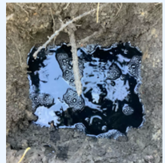
Sewage surfacing at end of drainfield

Homes with sewage surfacing, backing up, damaged septic tank, laundry or kitchen waste discharging on the ground surface.