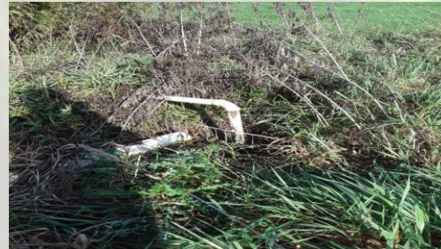
Sump pump discharging wastewater to ditch.

Number of homes that were identified discharging untreated wastewater to stream, ditch, field tile, or ground surface.