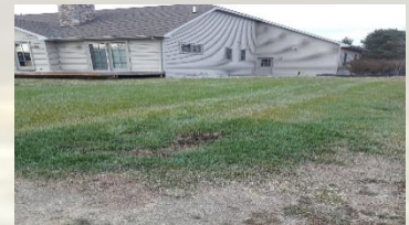
Sewage surfacing at end of drainfield.

Number of homes with sewage surfacing, backing up, damaged septic tank, laundry or kitchen waste discharging on the ground surface.